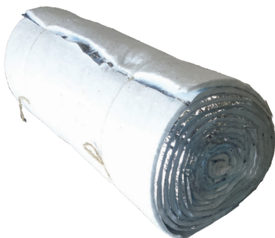
Reinforced Ceramic Fiber