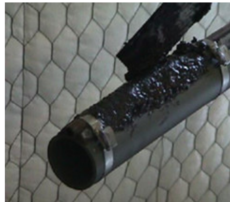
Typical hand trowel application

Note: Material Safety Data Sheet (MSDS) available.