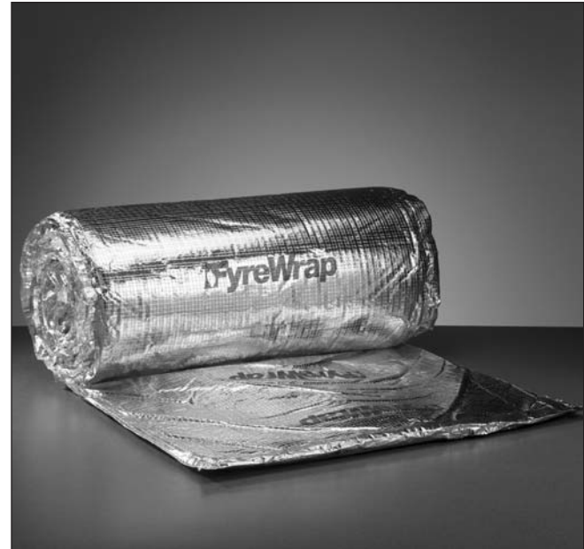
FyreWrap 0.5 Plenum Insulation

Core Material: FyreWrap 0.5 Plenum Insulation incorporates Insulfrax® Thermal Insulation as its core material. Insulfrax is a high-temperature insulation made from a calcia, magnesia, silica chemistry designed to enhance biosolubility. It provides excellent insulation in a noncombustible blanket product form.